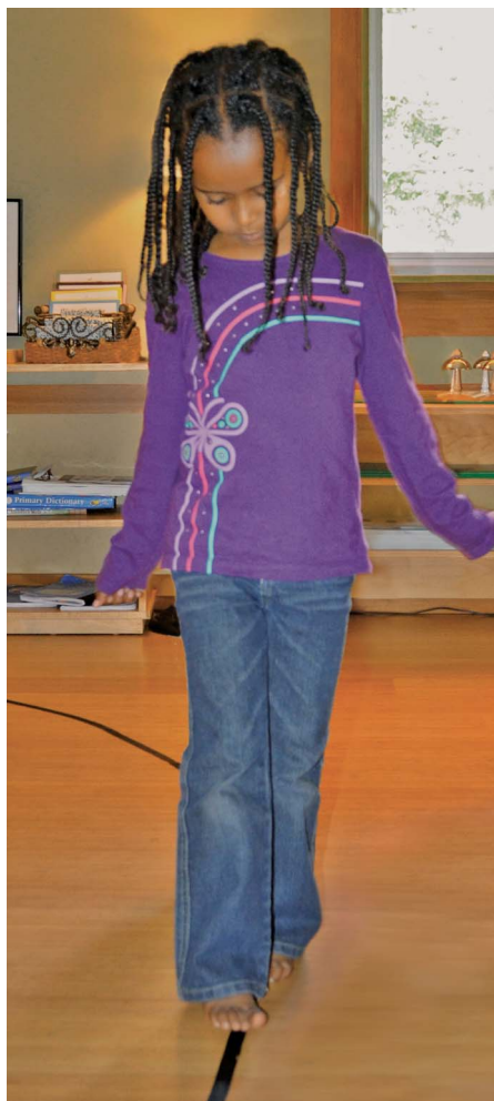
Fig. 3. Walking meditation in Montessori can be simply walking on a line (which required focused attention and concentration for young children) or walking on it without spilling water in a spoon or without letting your bell ring.

Montessori (36) curriculum does not mention EFs, but what Montessorians mean by “normal-